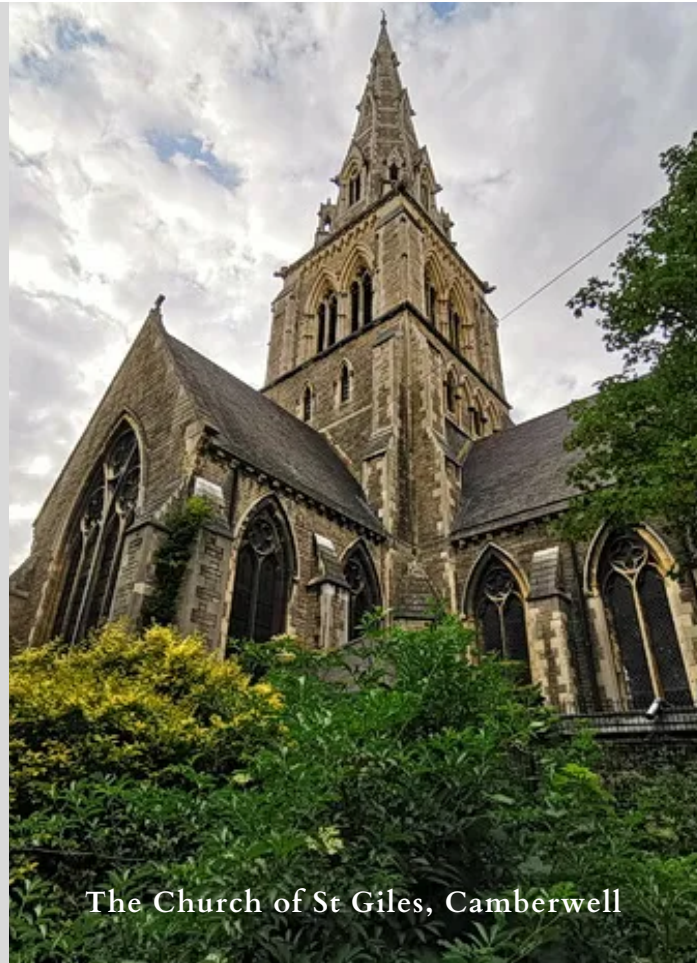
The Church of St Giles, Camberwell