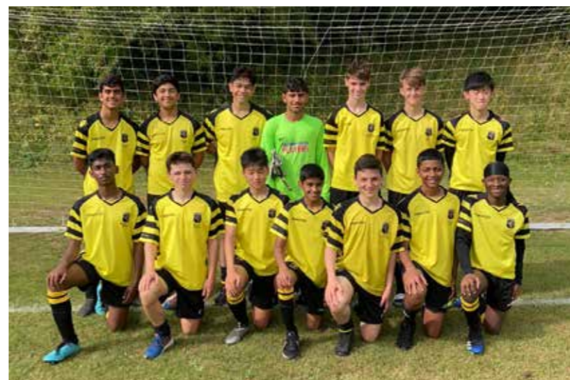
Pictured below: U15A Team of the Week