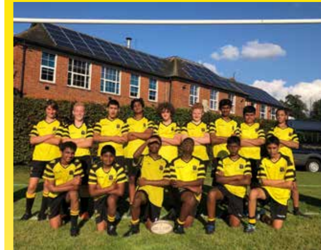
Pictured above and below: U14A Rugby vs. WCGS

Overall, a great first week of rugby and start to the competitive season.