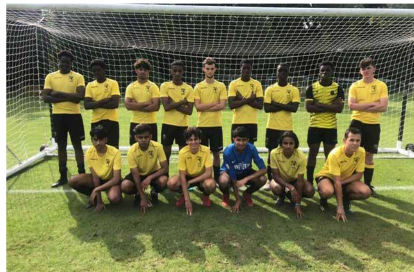
Pictured above: 2nd XI vs. John Fisher