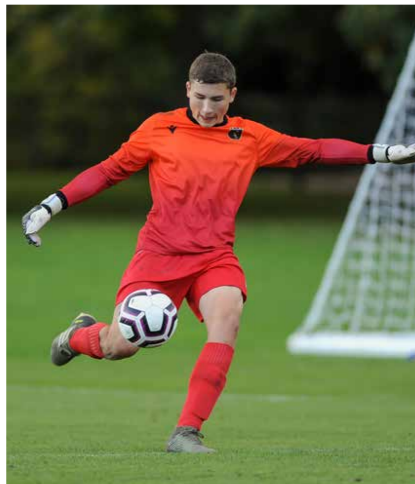
Pictured above: Ellis 1st XI Goalkeeper.