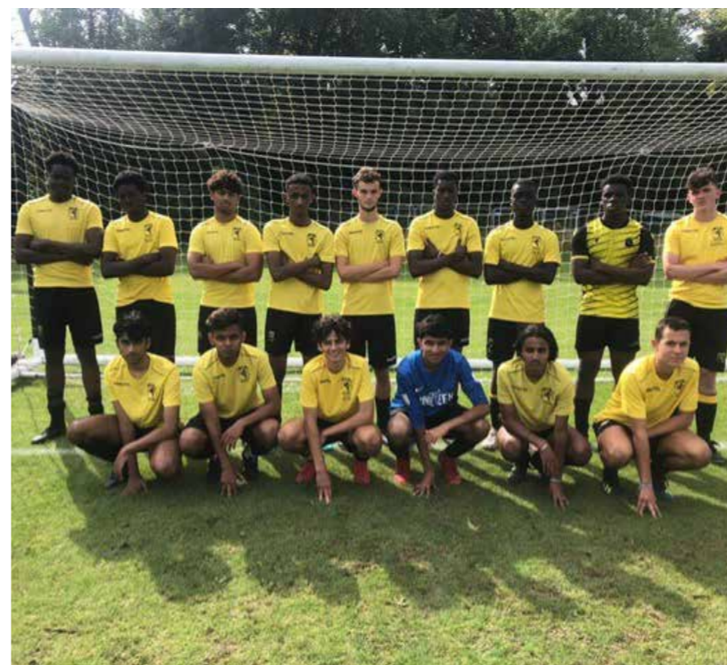
Pictured below: The first win for 2nd XI team.