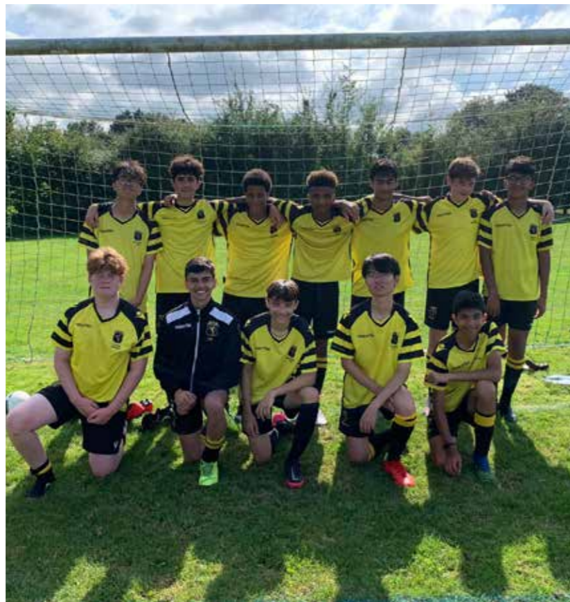
Pictured below: 5th XI Team of the Week