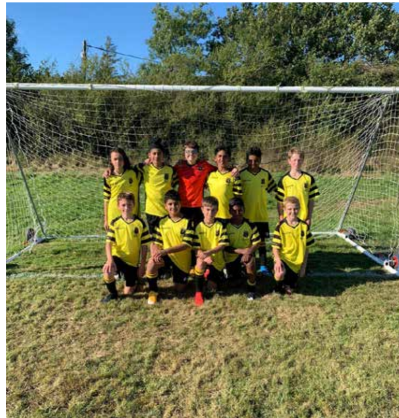
Pictured above: U12A vs Riddlesdown