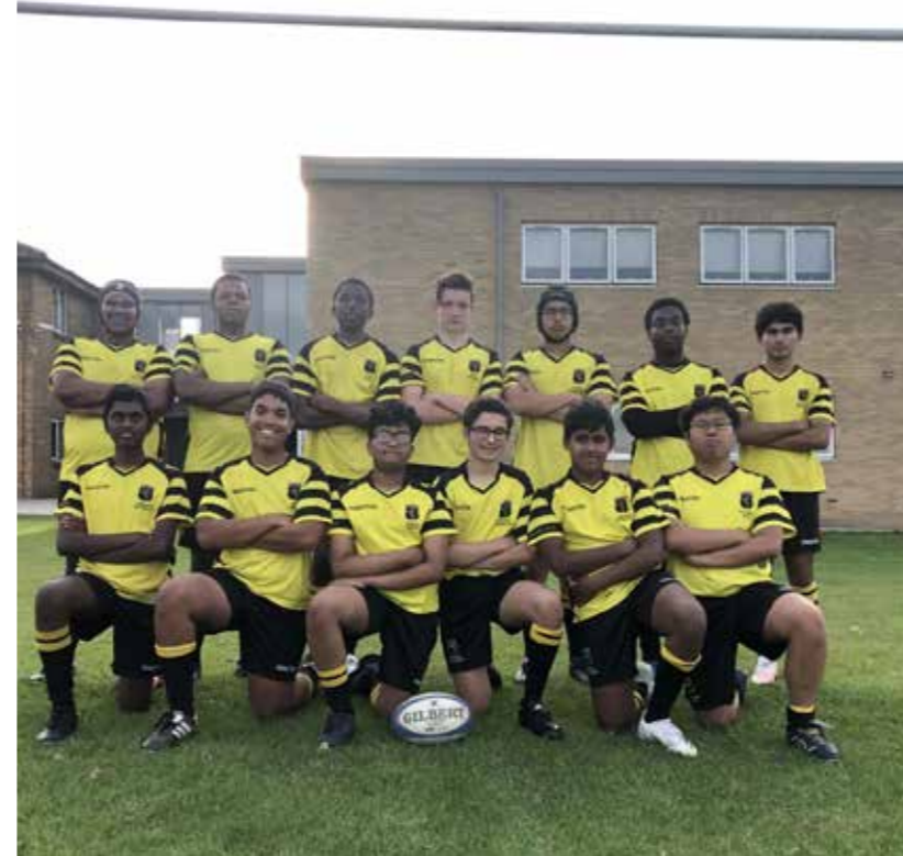
Pictured above: U15A rugby vs. Wallington County Grammar School.