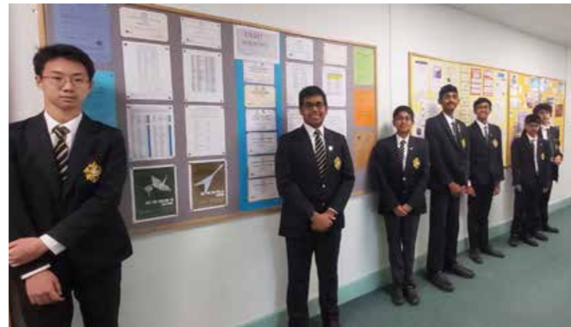
Pictured above: Year 7 - 9 prizewinners. Pictured below: Participants with their certificates.